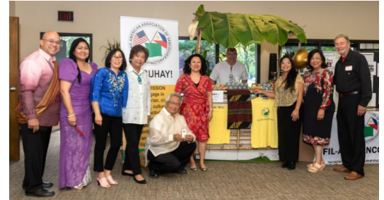
Top: FAAV's Board Members and spouses. Bottom: Military veterans with retired Major General Antonio M. Taguba.

I'm very proud you and your accomplishments! Let us continue to join hands and unite our Filipino -Americans with "Community", "Collaboration" and "Connection". Thank you for your continued support of CFAA!!!