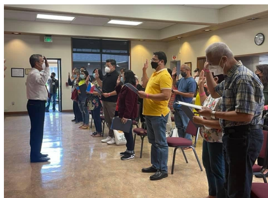
Oath-taking ceremony for the new Filipino citizens