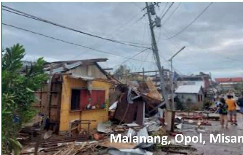
Malanang, Opol, Misamis Oriental

FAAV is raising funds to help victims of Typhoon Odette (Rai) which swept through the southeastern islands of the Philippines last December 16, 2021. Thousands are in need of basic necessities such as food, water, and shelter.