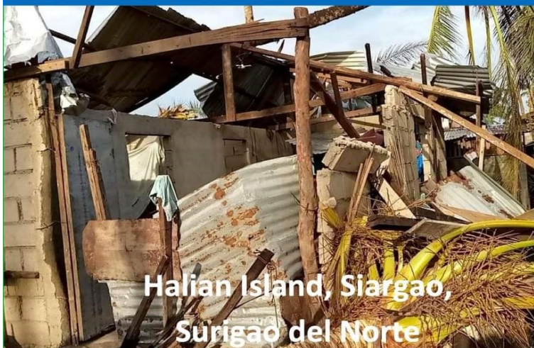
Halian Island, Siargao, Surigao del Norte